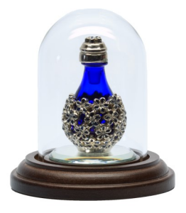
Card Inside: below right

THIS Forget The Itol Teor Cottle, like its namesake flower symbolizes faithfulness and enduring love. It is a touching remembrance of a loved one who may be gone but never forgotten.