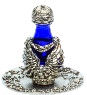
Blue/Silver Angel on silver tray Item# 3033/#6096

Includes: Tear Bottle Story Card, Organza Gift Bag and Choice of Gift Card: (1) Profound Loss Card -see pg. 23- provides wonderful imagery of seeing the angels carry tears to heaven OR (2) Angel Encouragement Card -see below-reminds those in difficult circumstances they are not alone.