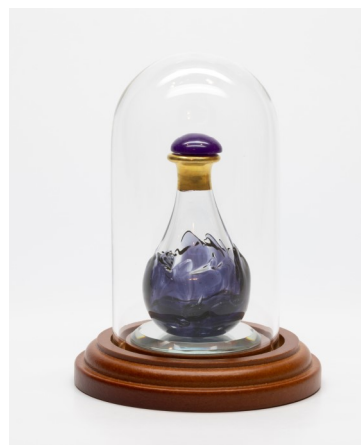
Blue Marble- Item#4108