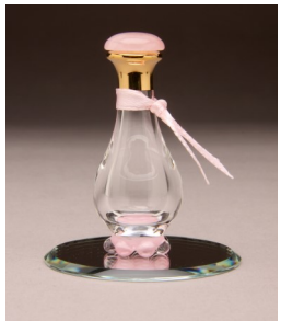
Item# 4085 Pink Ribbon Tear Bottle & Gift Card

Above is our hand-blown " Pink Ribbon Tear Bottle ". Created to symbolize hope, encouragement and support for those battling breast cancer, this tear bottle <u>comes with a Pink Ribbon Gift</u> that was designed with input from 5 breast cancer survivors!