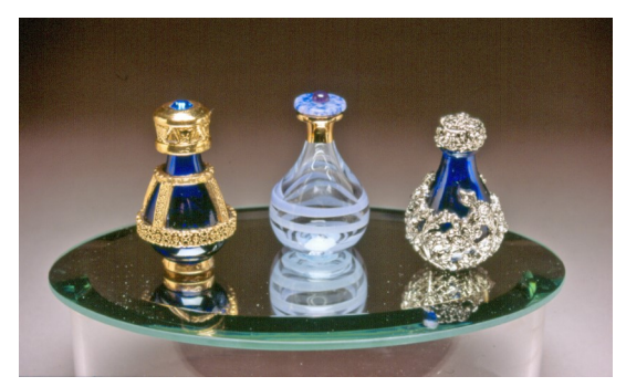
Pictured: Gold-banded Roma, Amethyst Contemporary & Silver Victorian Tear Bottles atop an Oval Mirror Riser (Item# 6829)

Let us help you serve this important market need with our exclusive, unique and made in the USA products.