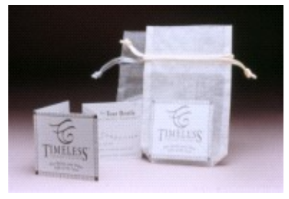
An organza gift bag & story card like those shown above come with each tear

• Small "Marriage Cards" with a touching quotation about marriage